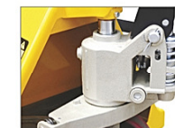
Integrated cast pump