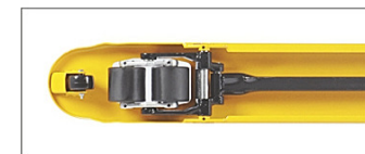
Standard with entry & exist Roller (option with single or double fork rollers)