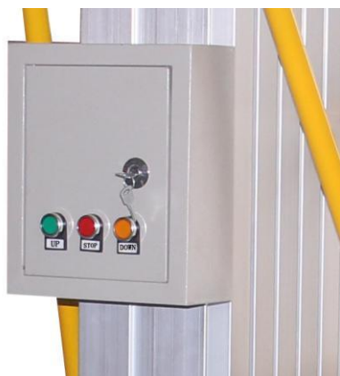
Control Box on the Mast